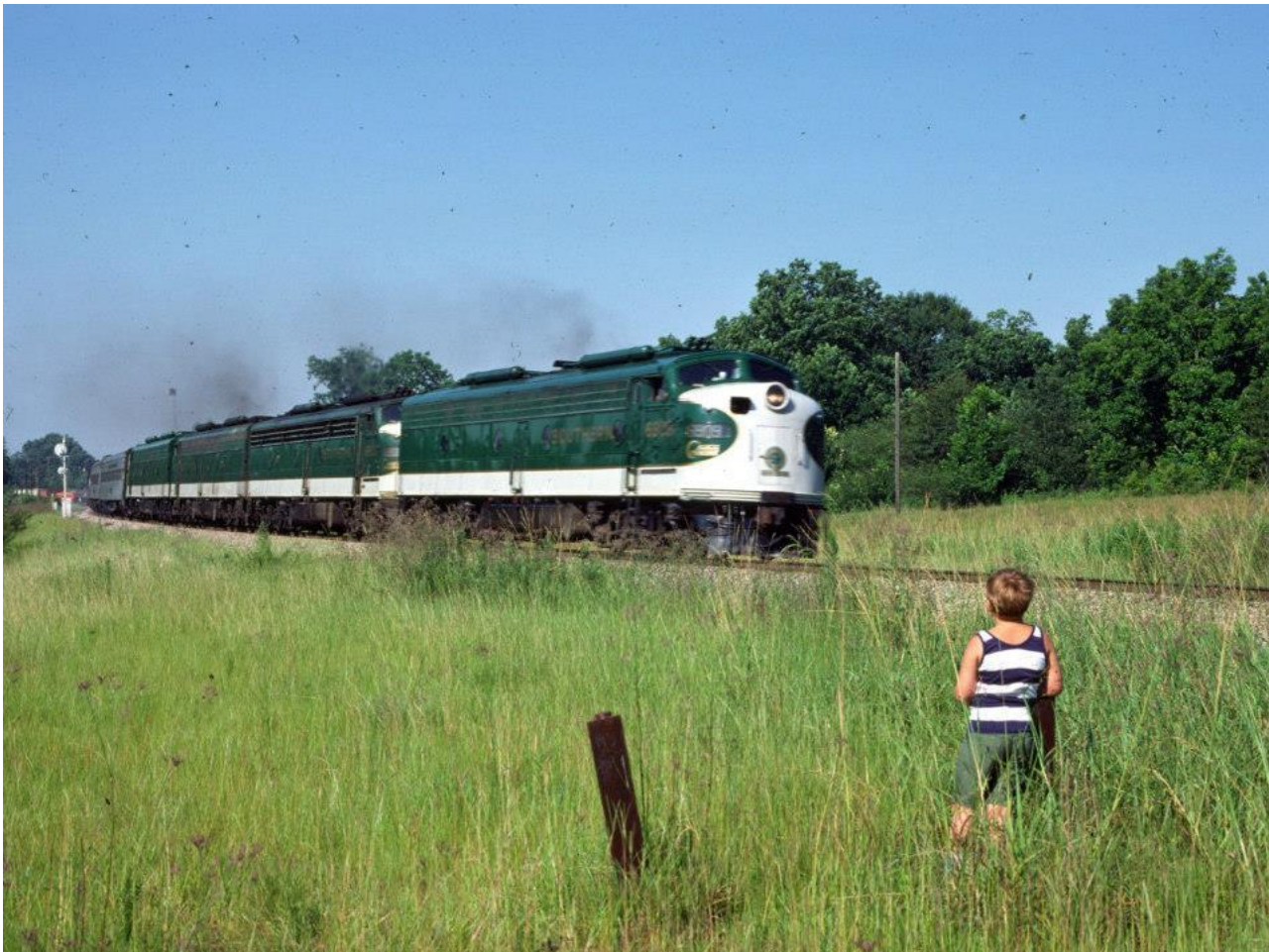
The northbound Southern Crescent at Purvis, MS in 1974. This photo is the background of LARP’s Facebook page – follow us on Facebook to frequent updates, news, and photos.