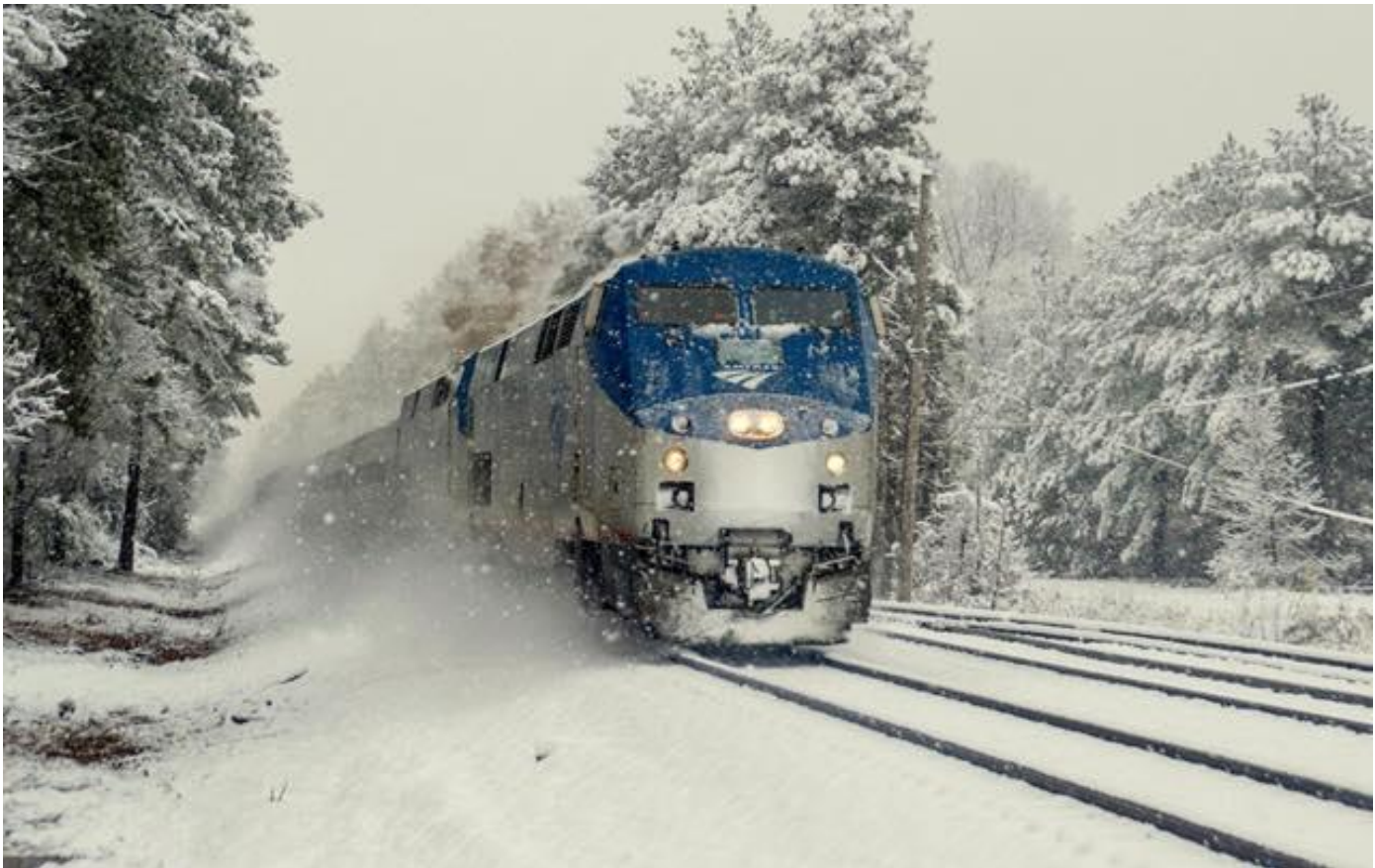
Amtrak #19, the southbound Crescent, at Brompton, AL, 12/8/17.